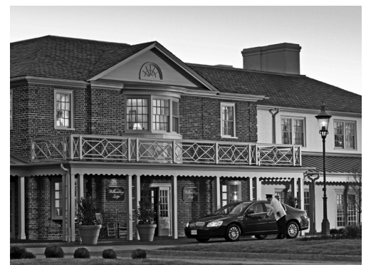
The Williamsburg Lodge

IIAV expects hundreds of insurance professionals from the insurance industry to participate in the 2009 IIAV Exhibition. Best of all, IIAV's convention attracts the real decision-makers from around the state. Exhibitors will have the opportunity to meet with the people who make and influence the buying decisions.